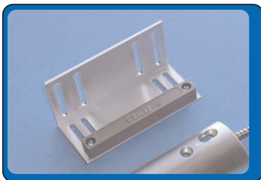
BRACKET - P/N 316