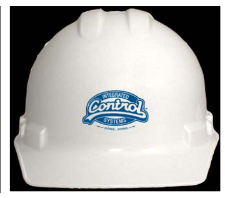
Available in standard, ratcheting, and full brim. Contact your account representative for more information. Made in USA.