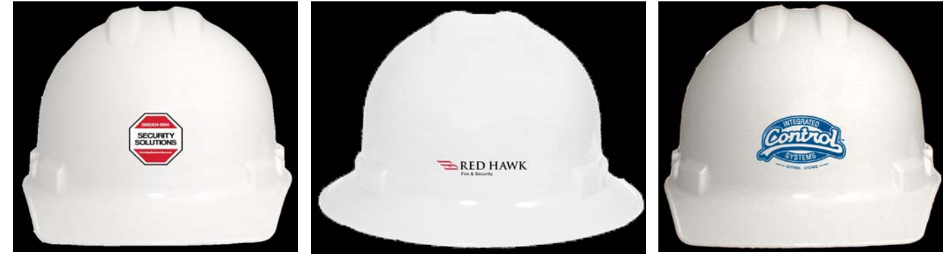
Available in standard, ratcheting, and full brim. Contact your account representative for more information. Made in USA.